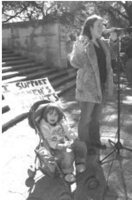
Future Lilith volunteer with her mother at the Voices for Choice rally.