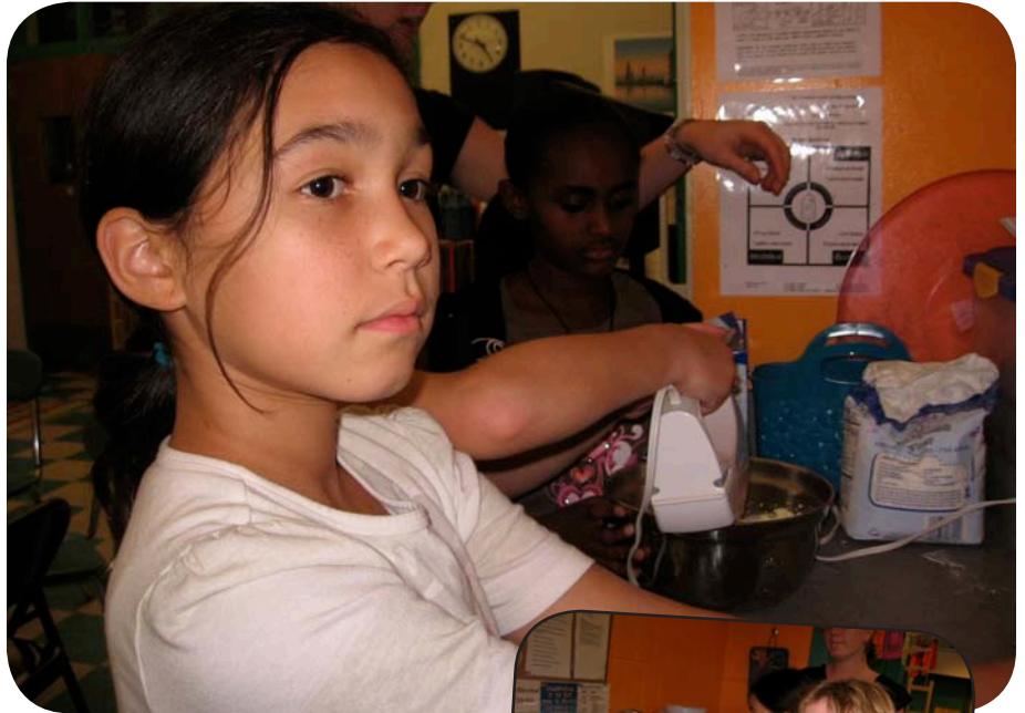
Iron chefs at work.