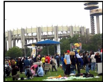
100,000 people gathered for the finale of the Immigrant Workers Freedom Ride