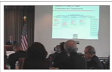
The Conference offered a myriad of panels by experts.

Representatives of Afghan Communicator were present for the duration of this conference.