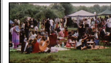
Families picnicking on the lush green grass & enjoying the festivities throughout the day at the Afghan Heritage Day.