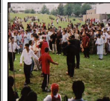
Young men dancing in front of Stage at the Afghan Heritage Day—August 17, 2003