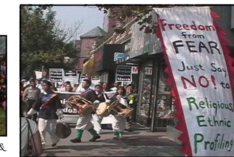
Led by Chinese dragon drums, the Rally passed through Jackson Heights with organizations displaying banners.