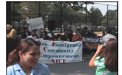
The Immigrant Workers Freedom Rally ended at a Corona Park, with moving speeches.

در ۲۰ سپتمبر، اعضای افغان کمیونیکیتور در مارش که برای خواستن حق برابری برای مهاجرین و مسلمانان گرفته شده بود شرکت کردند. این مارش که در جکسون هایت کوینز برگزار شده بود، به استقبال مارش بزرگی که در ۴ اکتوبر در فلاشنگ میدو پارک با اشتراک از ده ها هزار نفر از سراسر آمریکا برگزار میشود، گرفته شده بود. از هموطنان عزیز خواهش نمودیم که در این مارش شرکت گرفته و با آواز بلند به دولت آمریکا ناراضیت خود را بخاطر رفتار ناگوار پولیس و دفتر ایمیگریشن در مقابل افغانها و مسلمانان هویدا بسازند. برای معلومات بیشتر بدقت ما لطفا تیلیفون بزنید.