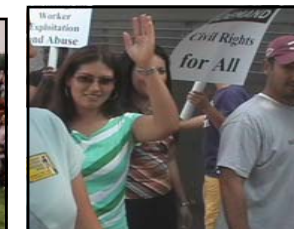
AC staff taking part in the Immigrant Workers Freedom Rally