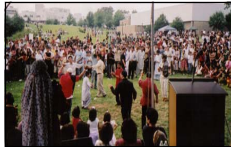
National Attan Dance at AHD by attendees.