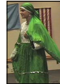
AC volunteer models colorful Afghan clothing on the catwalk.