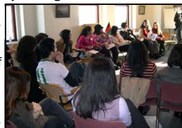
Young Afghans met at a Town Hall meeting organized by Afghan Communicator.

The goal of the event as envisioned by Afghan Communicator was to create a space for young Afghans to network with each other and discuss the issues facing Afghan-American professionals today.