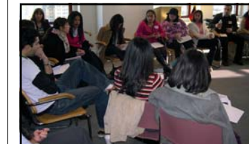
The group spent the Sunday afternoon discussing identity and assimilation.