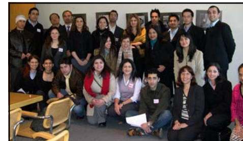
Town Hall attendees and AC staff pose for a picture at the conclusion of the meeting.

خانم بوجوانی از تجلیل روز زن توسط جامعه افغانی هم یاد اوری نمود.