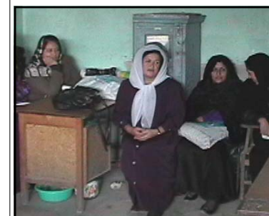
Teachers of Amir S. Ali Khan School