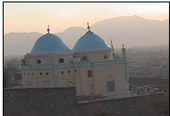
The Sakhī Tomb in Kart-e Sakhī , Kabul