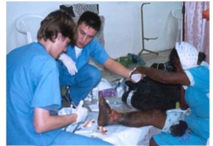
Students deciding on a plan of care

The town's city hall was used as the clinic location and 280 patients were seen with a variety of ailments. Medications were dispensed and graciously donated from local hospitals in the Dallas area. The students were introduced to the process of taking a history and physical as well as how to triage patients. We expect they will return to this area in the near future as practicing physicians!