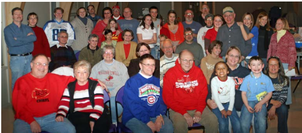
Super Bowl