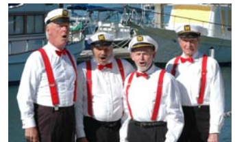
A quartet from the Beaufort Harbormasters