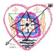
Artwork from students